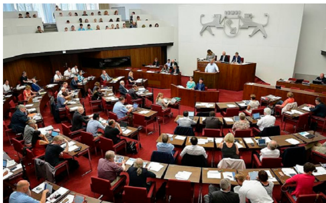
The majority at the Bremische Bürgerschaft, the legislative branch of the Free Hanseatic City of Bremen in Germany, joined the signatories.

change and to take decisive steps against the current regime. This includes blacklisting the IRGC and holding regime officials accountable for their crimes against humanity."