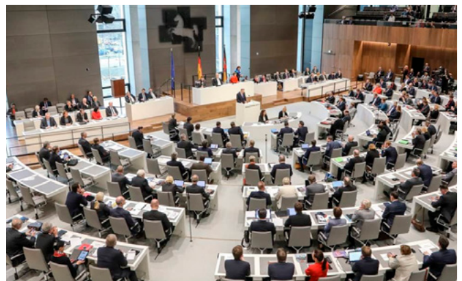
The majority of representatives in the Bundestag's Lower Saxony state also signed a similar statement.