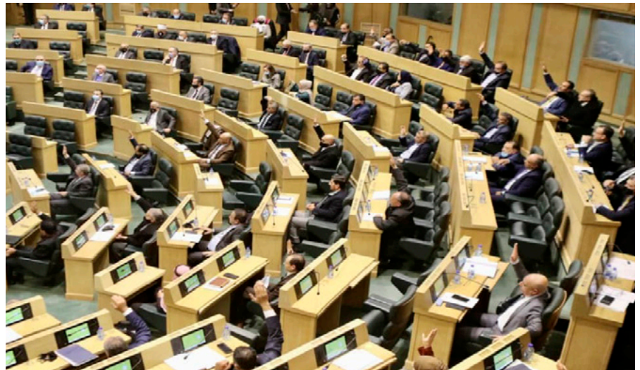
The majority of parliamentarians in Jordan (above) and in Yemen (below) signed the statement in support of a secular republic Iran.

In their statement the signatories condemn "the Iranian regime's meddling in the Middle East region