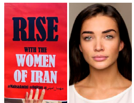
Actress Amy Jackson is among millions of people expressing support for Iranian women.

The widespread support for the protests in Iran does not fit in this newsletter. It is sufficient to know that #MahsaAmini has been circulated over 200 million times.