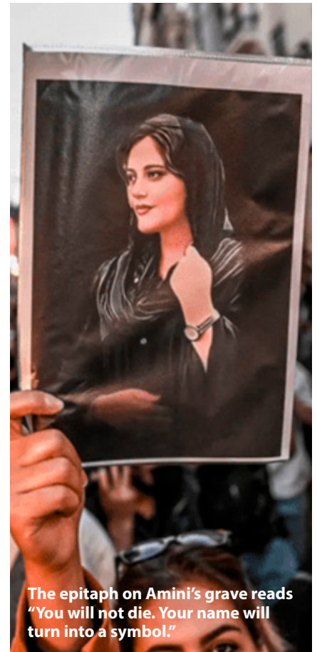
The epitaph on Amini's grave reads “You will not die. Your name will turn into a symbol.”