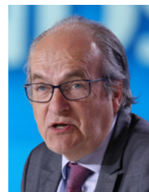
Ad Melkert, former leader of Dutch Labour Party and the Special Representative of the UN Secretary General in Iraq:

“Suppose the face of Iran was a brave woman in a country that recently has had a history, and a region of the world, of treating women inhumanely, and this brave woman will be the face of the new, modern, liberated Iran.”