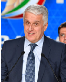
Pandeli Majko, former Prime Minister of Albania:

More than 60 personalities from all corners of the world addressed the Paris event. Excerpts of some of those speeches appear below.