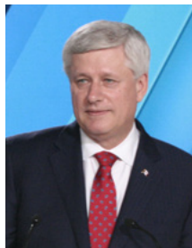
Stephen Harper, Prime Minister of Canada 2006-2015:

“Friends, we are here today, I am here today, not to tell Iranians who their future