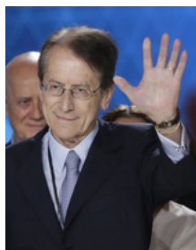
Giulio Terzi, former Foreign Minister of Italy:

“Each and every one of us need to stand in solidarity with the people of Iran and come together and state clearly that the notion that Hassan Rouhani is a moderate or is a reformer, simply put, is a fraud.”