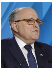
Rudy Giuliani, former Mayor of New York:

“They are defying the mullahs, and they continue to need your support to do that. Women will continue to lead this movement and it is among the greatest threats to the current regime.”