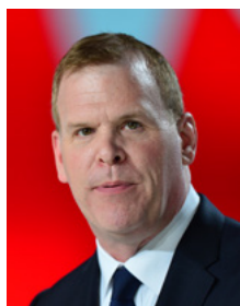
John Baird, former Canadian Foreign Minister:

“The great struggle of our generation is the struggle against terrorism, and the regime in