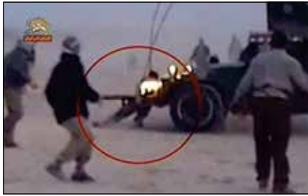
The massacre on 8 April 2011 took 36 lives at Camp Ashraf.

Agency (UNHCR) to put its weight behind the campaign to recognize Camp Liberty as a refugee camp under the UN flag. Other demands raised by the 25 human rights organizations and dignitaries include an end to the blockade on Camp Liberty, respect for the residents' freedom of movement and full access to medical services and legal representation for the residents.