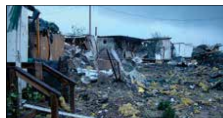
Camp Liberty after the rocket attack last October.

The most recent rocket attack on Camp Liberty took place on 29 October 2015 when 80 rockets rained down on the tiny camp and took the lives of 24