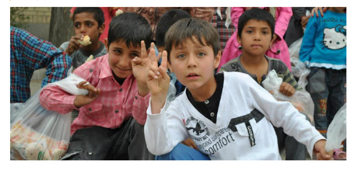
"WE MAKE A LIVING BY WHAT WE GET, WE MAKE A LIFE BY WHAT WE GIVE"