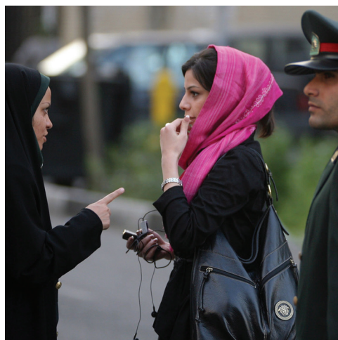
An Iranian woman being harassed by the 'Morality police' for her clothing

The families of victims of 30,000 prisoners massacred in 1988 commemorate the martyrs by holding their pictures and tulips in Paris, 1 July 2018