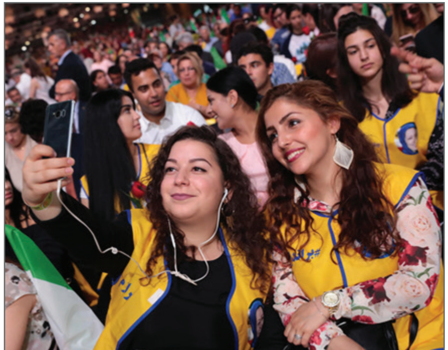
In Paris at the Iranian Grand Gathering, solidarity between Iranians and supporters of Iranian resistance on behalf of prisoners, the martyrs of the 1988 massacre.