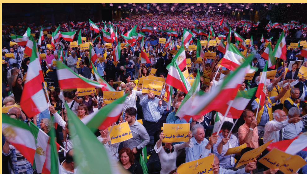
The families of victims of 30,000 prisoners massacred in 1988 commemorate the martyrs by holding their pictures and tulips in Paris, 1 July 2018