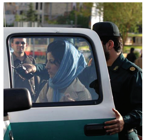
Another Iranian woman being detained by the 'Morality police'