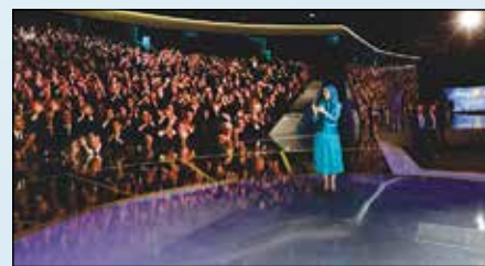
Former residents of Ashraf joined the gathering from Tirana via satellite.

[The] more I get to know you, the more I love you. The more I get to know your history, the more my heart is filled with pain but also my spirit is filled with hope that together we work for the future.